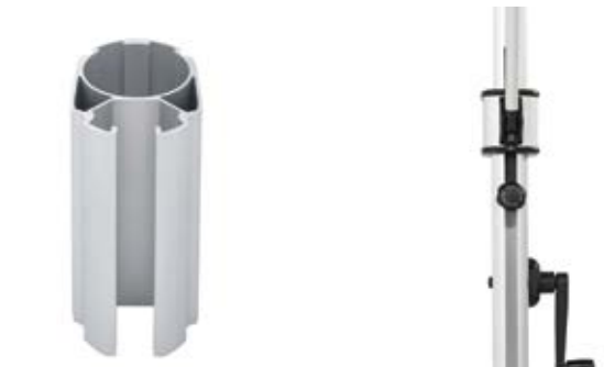
EXTRUDED ALUMINUM MAST