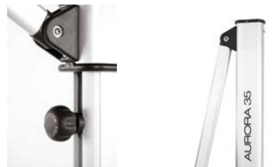
EASY-GLIDE ACTION SLIDER CAR